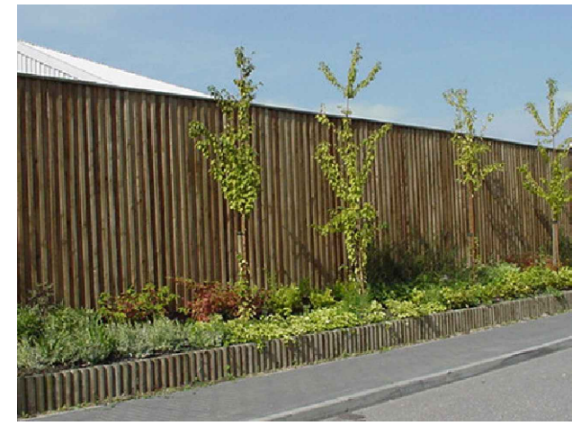
TYPICAL CLOSED BOARD FENCE IMAGE